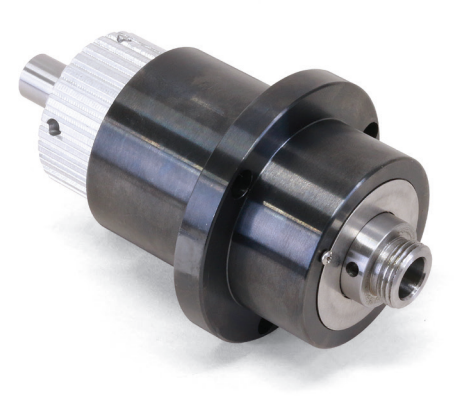
(P/N 6505 shown)